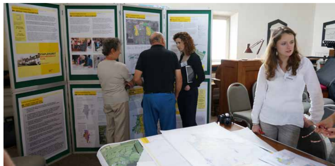
A drop-in event, including presentations and poster exhibition, was held in June 2014 at the beginning of the Regulation 14 pre-submission consultation period on the draft Neighbourhood Plan.

Comments can continue to be sent by email to: